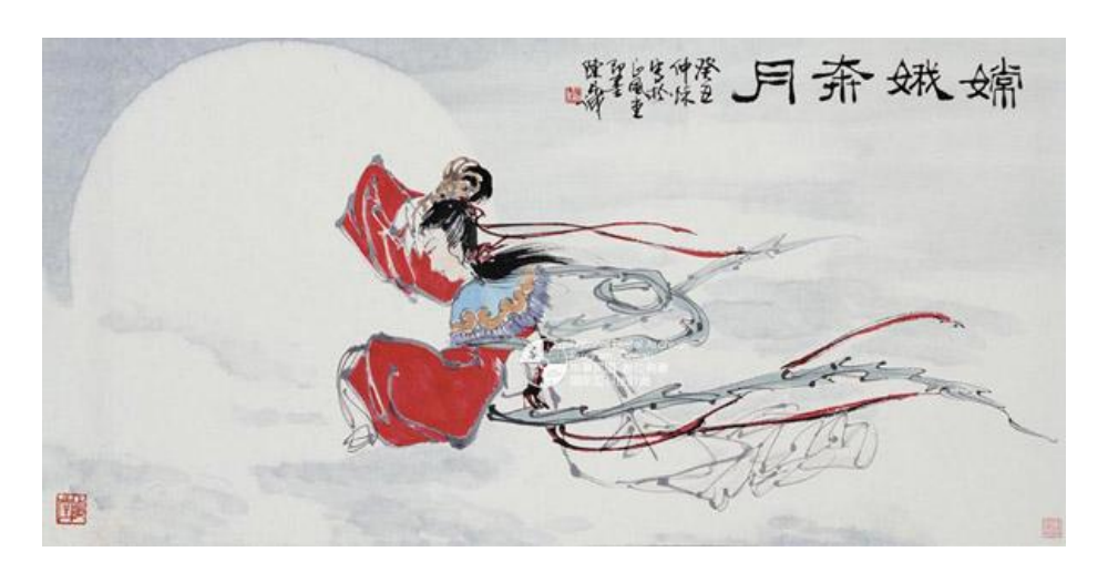
Chang E is flying to the Moon.