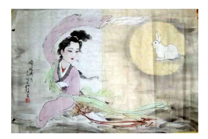
This one and the one on the next page might be suitable for the last scene in which Chang E is reciting a poem (by Li Shangyin, one of the famous poets in Tang Dynasty) titled "Chang E".