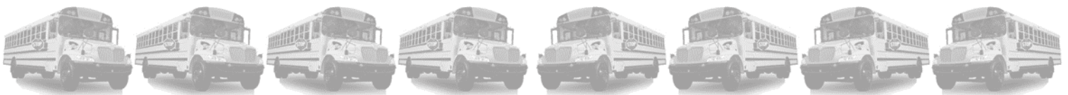
(TT) School safety zone decal