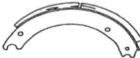
Out-of-Service Cracks or voids that exceed 1/16" in width. Cracks that exceed 1-1/2" in length.