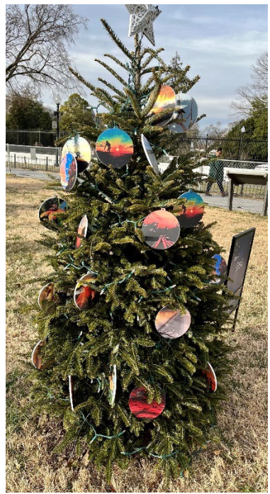
Figure 3- Side angle of 2022 State of Ohio Christmas Tree at the Whitehouse.

This year, submissions from Liberty Tree Elementary (2020), Shawnee Local Schools (2021) and Lakota Central High School (2022) will be showcased on Ohio's tree.