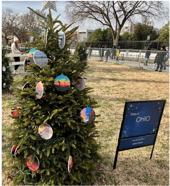
Figure 1- 2022 State of Ohio Christmas Tree at the Whitehouse. Ornaments designed by Lakota Central students.

Each year, the National Park Service and the National Park Foundation host the National Christmas Tree Lighting Ceremony in President's Park, one of America's 423 National Parks. The President is invited to light the National Christmas Tree in front of a live audience, which is recorded for national broadcast a few days