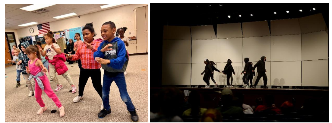
Figure 1 – LEFT: Frank Jacinto Elementary School students practice the steps to a Cuban dance routine. RIGHT: The April 20 All-City Art Show allowed high school students to showcase a dance routine for the first time.