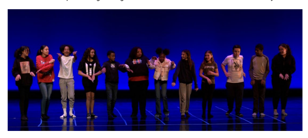
Figure 4-Lorain City School Districts performing onstage.