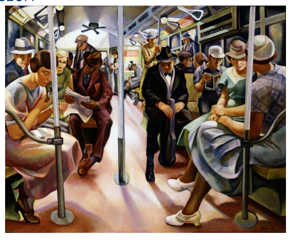
Figure 7- Lily Furedi's Subway (1934). Image courtesy of the Smithsonian American Art Museum