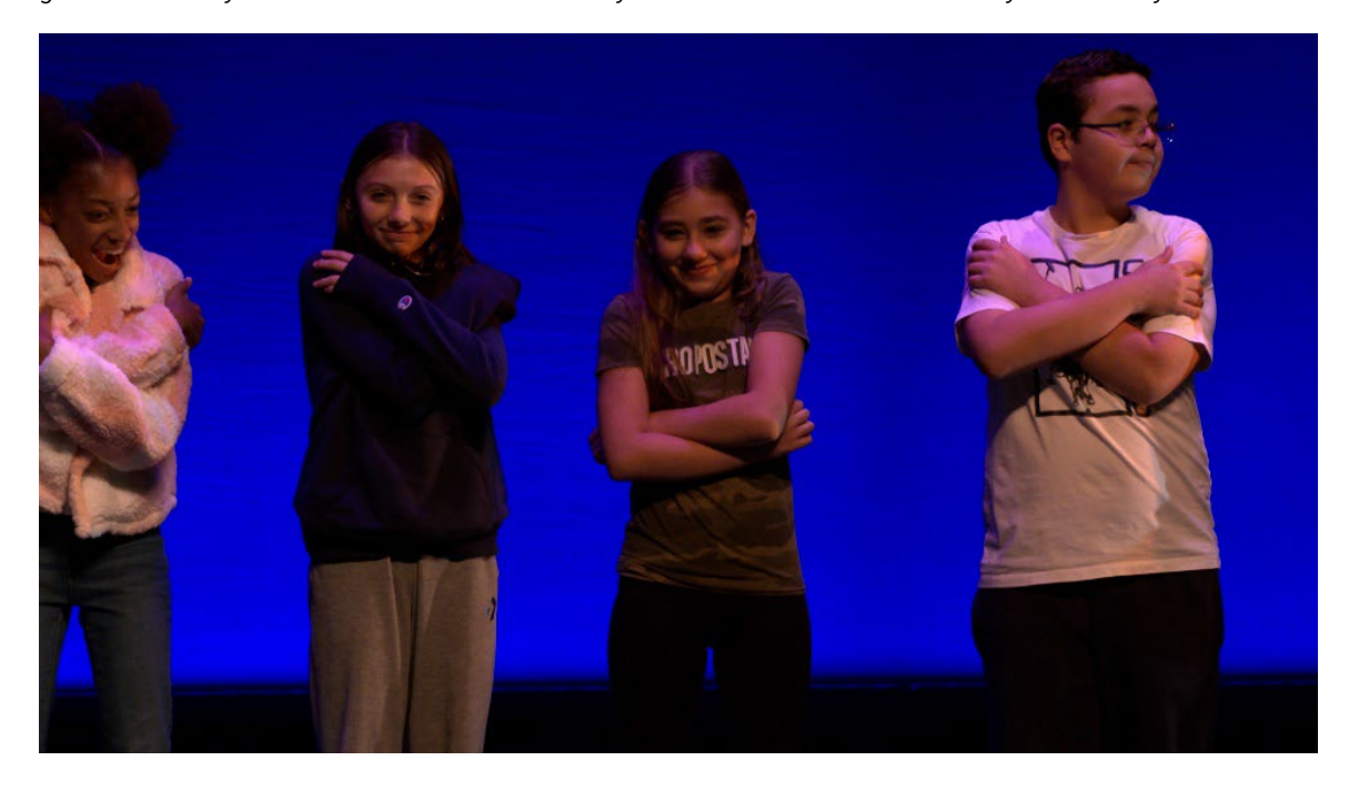
Figure 2- Lorain City School District Students Perform with Groundworks Dance at the Allen Theatre in Cleveland.