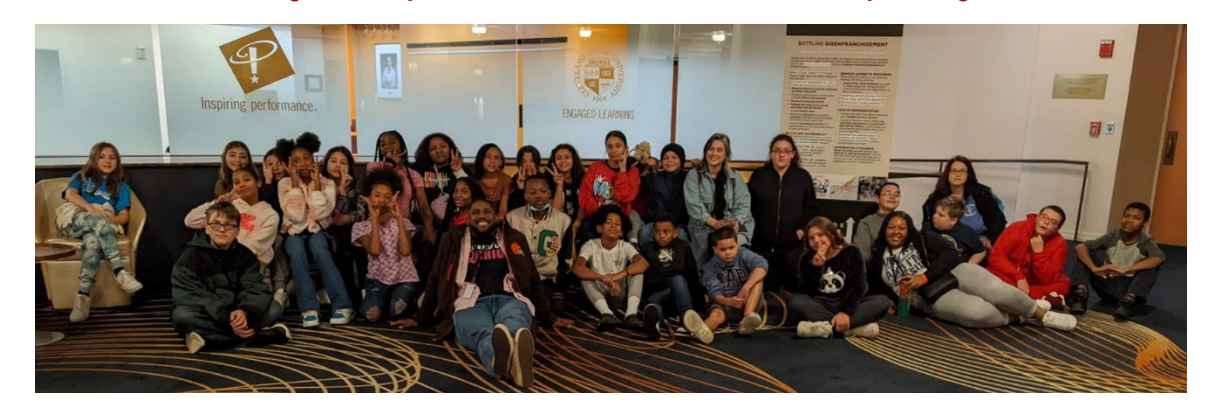
Figure 1- Lorain City School District students in the lobby of the Allen Theatre.

"The collaboration between Groundworks Dance and Lorain City Schools illustrates the power of the arts in nurturing creativity, confidence and a sense of community among students.<sup>1</sup>"