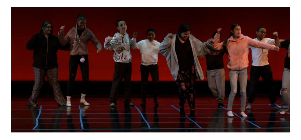
Figure 3- Lorain City School District students performing on stage at the Allen Theatre in Cleveland.