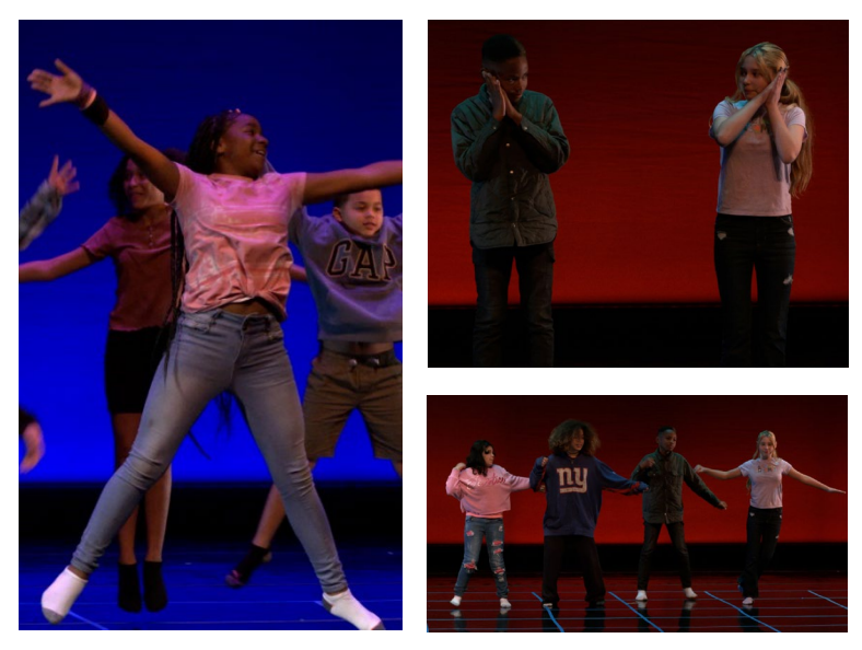
Figure 5- Lorain City School District students performing in Cleveland. Photos courtesy of Lorain City School Districts performing onstage. Photo courtesy of Lorain City School District

Learn more about this exciting opportunity for Lorain City School District students by watching <u>the video report</u>, or by <u>reading the article</u>.