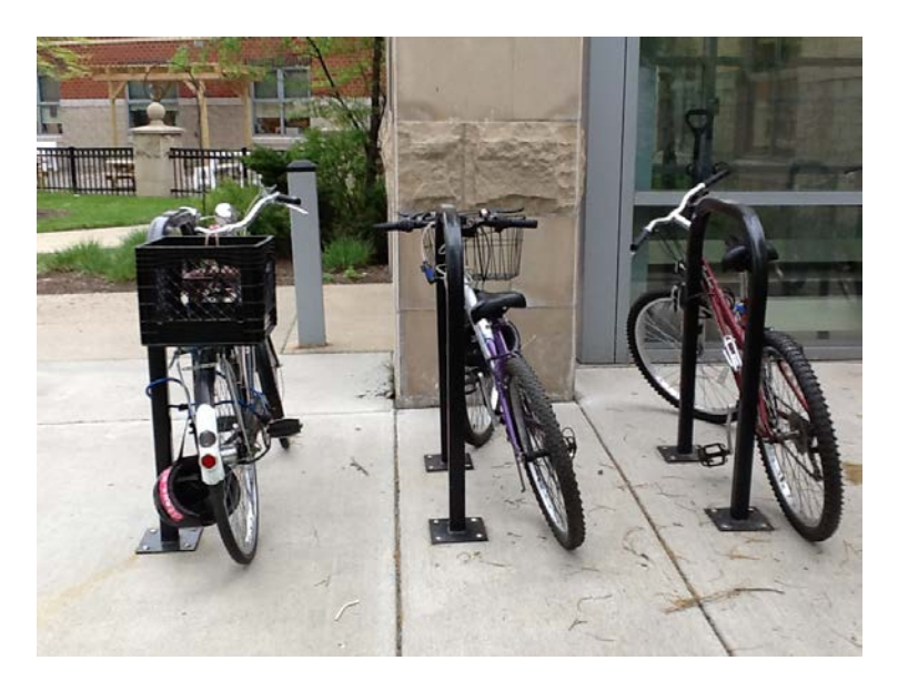
One of three UCS bike racks.

In addition, we use one school bus for all field trips, which can hold up to 84 students. We always schedule two or more classes to ride together. The UCS staff carpools for all in-services that take place away from our school building.