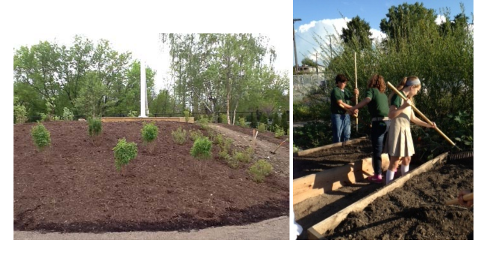
The UCS Learning Garden