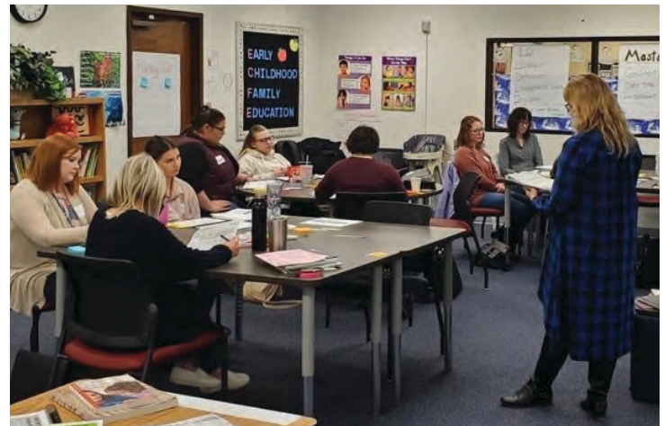
DRDP Training at the Paul Bunyan Center

The multi-tier system of supports (MTSS) specialist and reading coach for Bemidji Area Schools also offered a phonemic awareness training. This training, geared toward early childhood and primary educators, was extended to Bemidji Head Start.